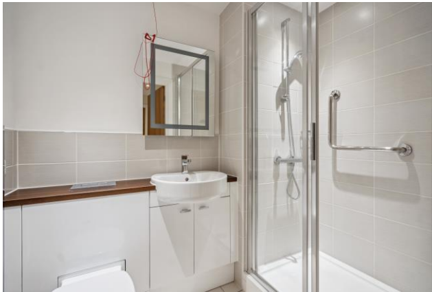
SHOWER ROOM modern white suite comprising fully enclosed shower cubicle with wall mounted shower unit and tiled surround, low level w.c. with enclosed cistern, ceramic hand wash basin with storage under, heated towel rail, part tiled walls and tiled floor.