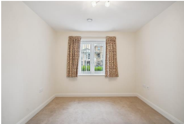
BEDROOM TWO front aspect room with double glazed window.